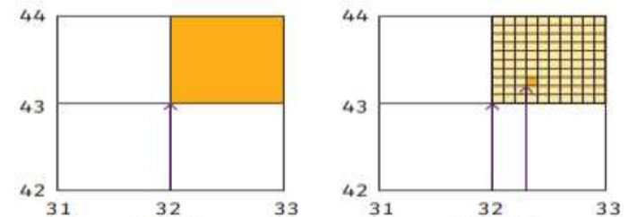
Four-figure and six-figure grid references.